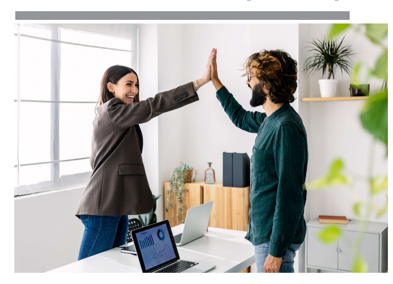
DPBH and UNR Collaboration Link to SHA: State Health Needs Assessment